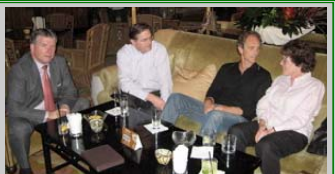
Sorry, Southern California, but low resolution image means small photo!